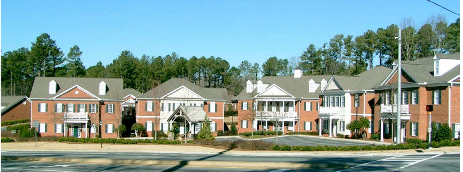
Providence Park , view from South

You own your home... You should Own Your Office